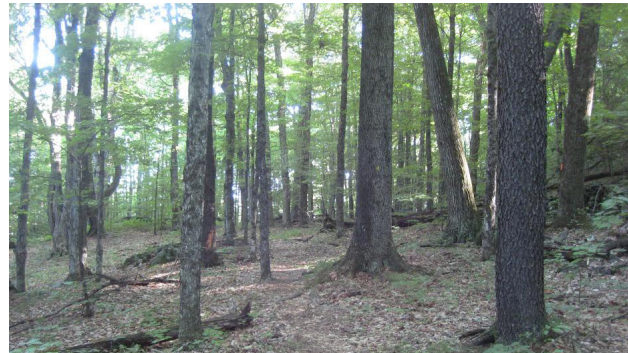
The two properties total 161 acres of forested slopes.

We thank you all. We are especially grateful to the Vermont Land Trust who worked with us helping to raise the funds to purchase and conserve this land. •