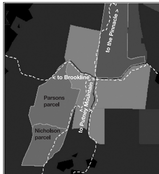
A new summit access trail will be flagged this summer.