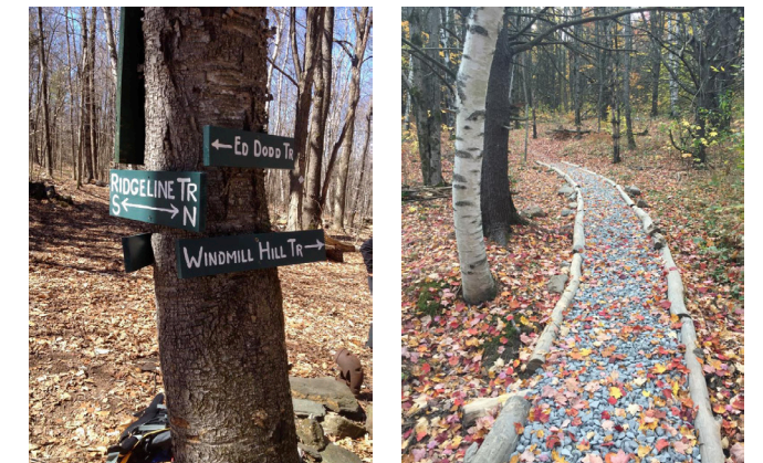
Keeping trails in good shape takes dedicated volunteers.

Trail construction is planned for summer 2019. There is an ongoing need for stewardship volunteers and openings for Trail Adoption. Work-days for trail-work and various other projects are being planned. All PMA members are invited and encouraged to get involved. See the PMA website for Trail Adopter and upcoming work-day information. •