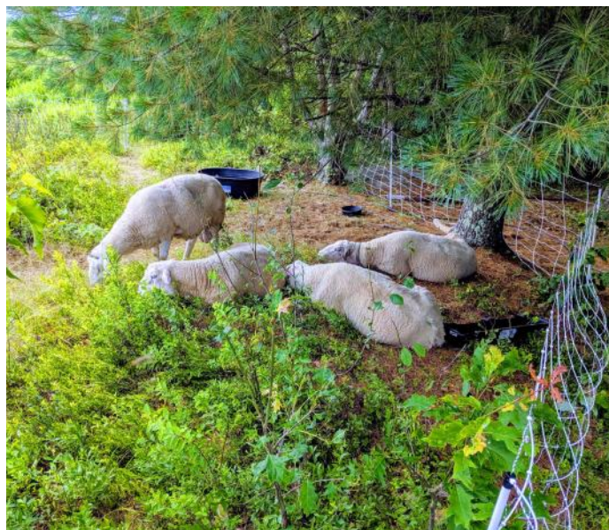
With rams from Vermont Shepherd farm

For six summers we have invited sheep to Putney Mountain summit to eat buckthorn. This photo says a lot. Notice the spindly shoots of buckthorn with very few leaves; in the right corner are healthy shoots of oak, and on the left vigorous birch leaves. Yes, the sheep actually prefer the buckthorn. When they have eaten most of the buckthorn leaves it's time to move the sheep to another location. As the summers of our grazing project have progressed we have been able to increase the range of the project and reduce the number of days the sheep are there. The buckthorn is having a hard time.